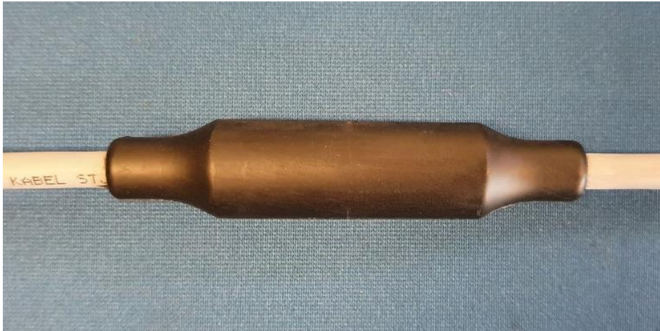
Epoxies - PUR - silicone gel